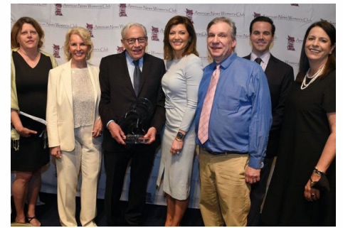
All-Star Lineup for ANWC's Benefit Dinner Honoring Bob Woodward for Excellence in Journalism includes, (l-r) Sally Buzbee , Sally Quinn , Bob Woodward , Norah O'Donnell , John Feinstein and Robert Costa .

CBS News' Norah O'Donnell and EJU recipient 2015 did a fantastic job emceeding the evening. Washington Posts, Sally Buzbee , Sally Quinn, and John Feinstein along with CBS News' Robert Costa all gave both touching and hilarious speeches about their individual relationships with Woodward.