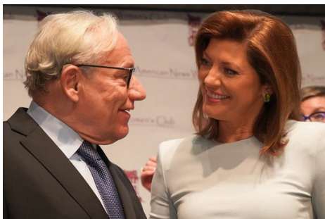
Bob Woodward and Norah O'Donnell.

ANWC celebrated its 90th Anniversary and honored the legendary Bob Woodward for Excellence in Journalism at the Press Club May 12, 2022. It was a spectacular evening reflecting on Woodward's accomplishments and the impact he has made over the past five decades. This year is particularly special because it is the 50th anniversary of Watergate. His focus was on the women who have helped support his career.